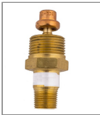
Freeze Protection Valve