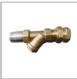
Filter for Water