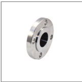
Flanged Water Inlet