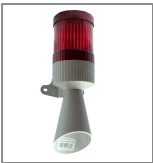
Audible and Visual Alarm