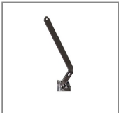
1" Valve Handle