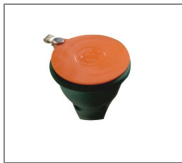
Rubber Dust Covers