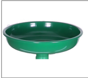
Eye Wash Bowl / Shower Head