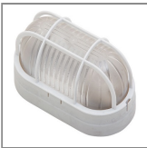
Internal and External Light