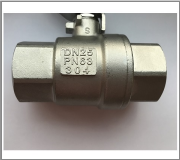
1" Ball Valve