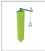
Test Kit for EN and/or ANSI